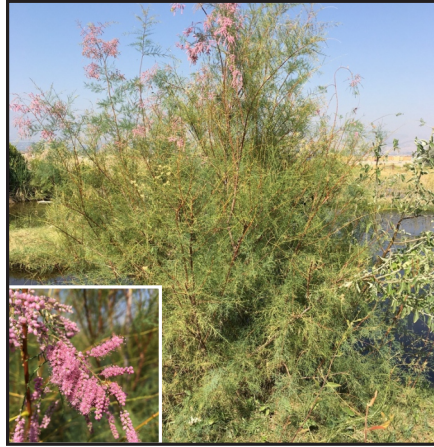
Salt Cedar ( Tamarix spp. ) - 20 to 25 feet tall, feathery appearance, small bright pink flowers.