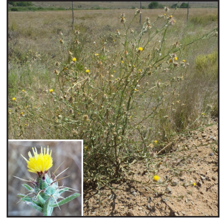
Malta Star Thistle ( Centaurea melitensis ) - Sharp spines at base, deeply lobed leaves with whitish appearance.