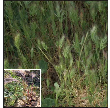
Red Brome Foxtail ( Bromus rubens ) - Dense panicle with purplish tinge.