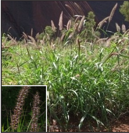
Buffelgrass ( Pennisetum ciliare ) - Bunched grass with round reddish stems.