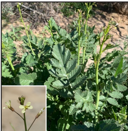
Sahara Mustard ( Brassica tournefortii ) - Butterfly shaped flowers.

Help save the Desert Habitat! To get involved in mapping these plants, please contact CAZCA at email cazca@dbg.org or call 480-481-8187. Or contact Maricopa County Parks Volunteer Coordinator at email parkvolunteer@mail.maricopa.gov or call 602 506-9510.