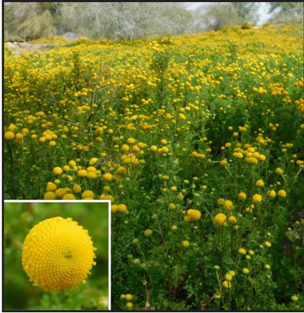
Stinknet ( Oncosiphon piluliferum ) - Plant is two to three feet tall with round globe flowers and spreading quickly.

These invasive species are outcompeting native desert species, which local wildlife depend on for food, shelter and habitat. Many of these invasive species form dense monocultures, altering the desert landscape and creating a hazardous fire risk. These species could be spreading in your area; early detection and eradication can prevent an invasion. Mapping these invaders is the first step to managing them, and preventing further spread.