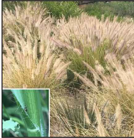
Fountain Grass ( Pennisetum setaceum ) - Purplish upright stems with long inflorescence.